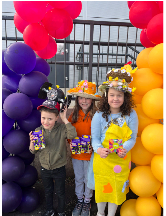
Easter Bonnet Prize winners in St Peter's NS