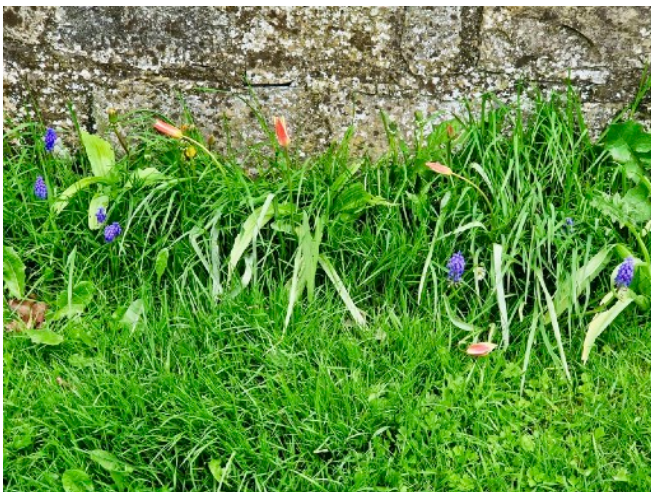
Flowers emerging in St Seachnall's from bulbs donated by the local Tidy Towns committee.

Another Dunshaughlin participant gained 5 points for achieving the following in a day: