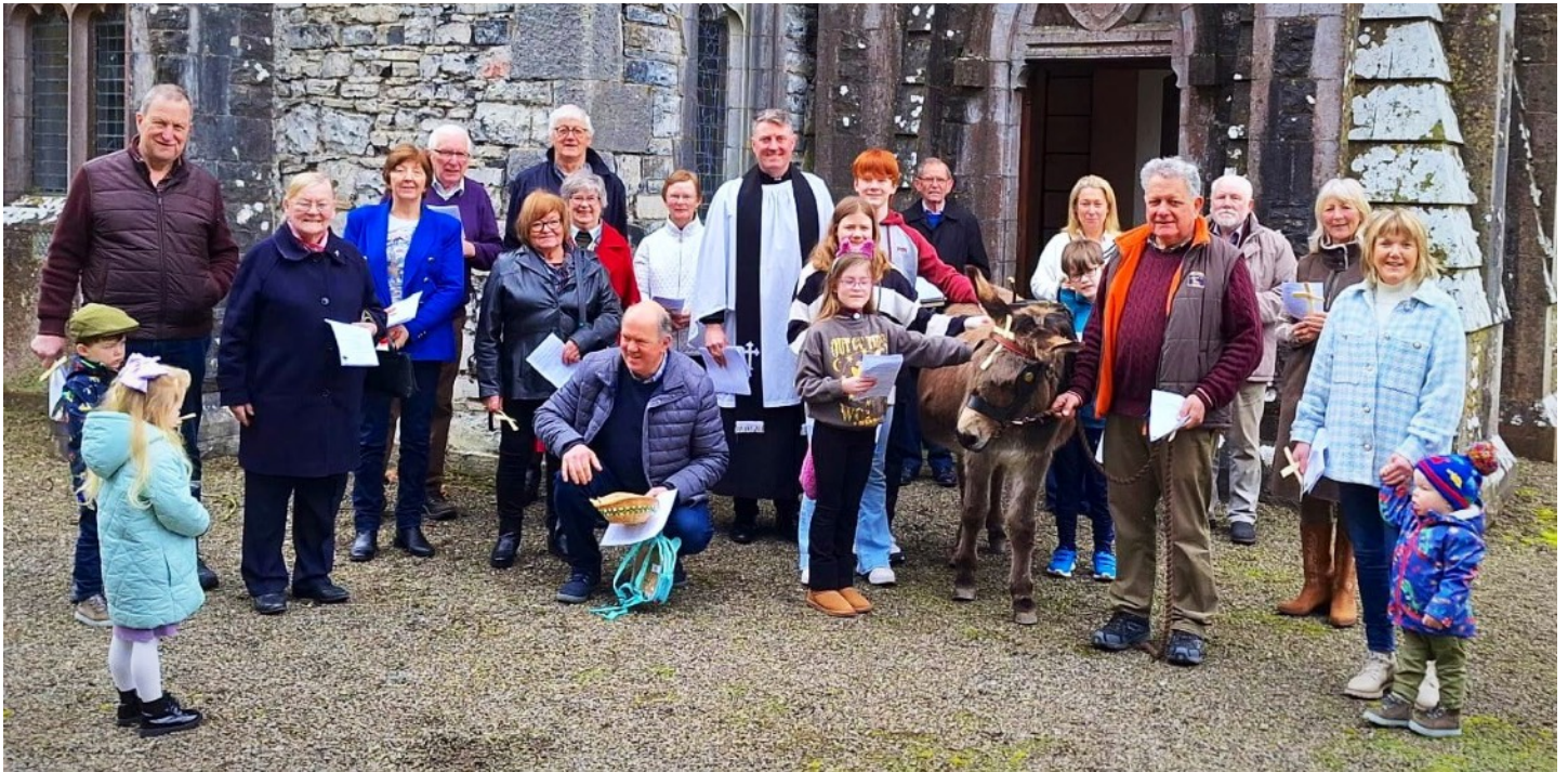
A wonderful live donkey led the Palm Sunday procession in Agher