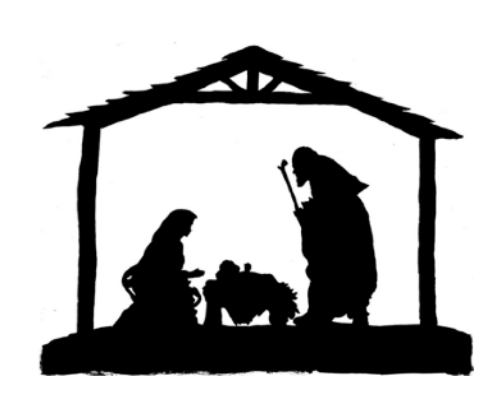
Sing ye of Bethlehem